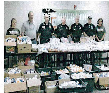
Drug Take-Back Event

To dispose of prescription and over-the-counter drugs, call your city or county government's household trash and recycling service and ask if a drug take-back program is available in your community. Some counties hold household hazardous waste collection days, where prescription and over-the-counter drugs are accepted at a central location for proper disposal.